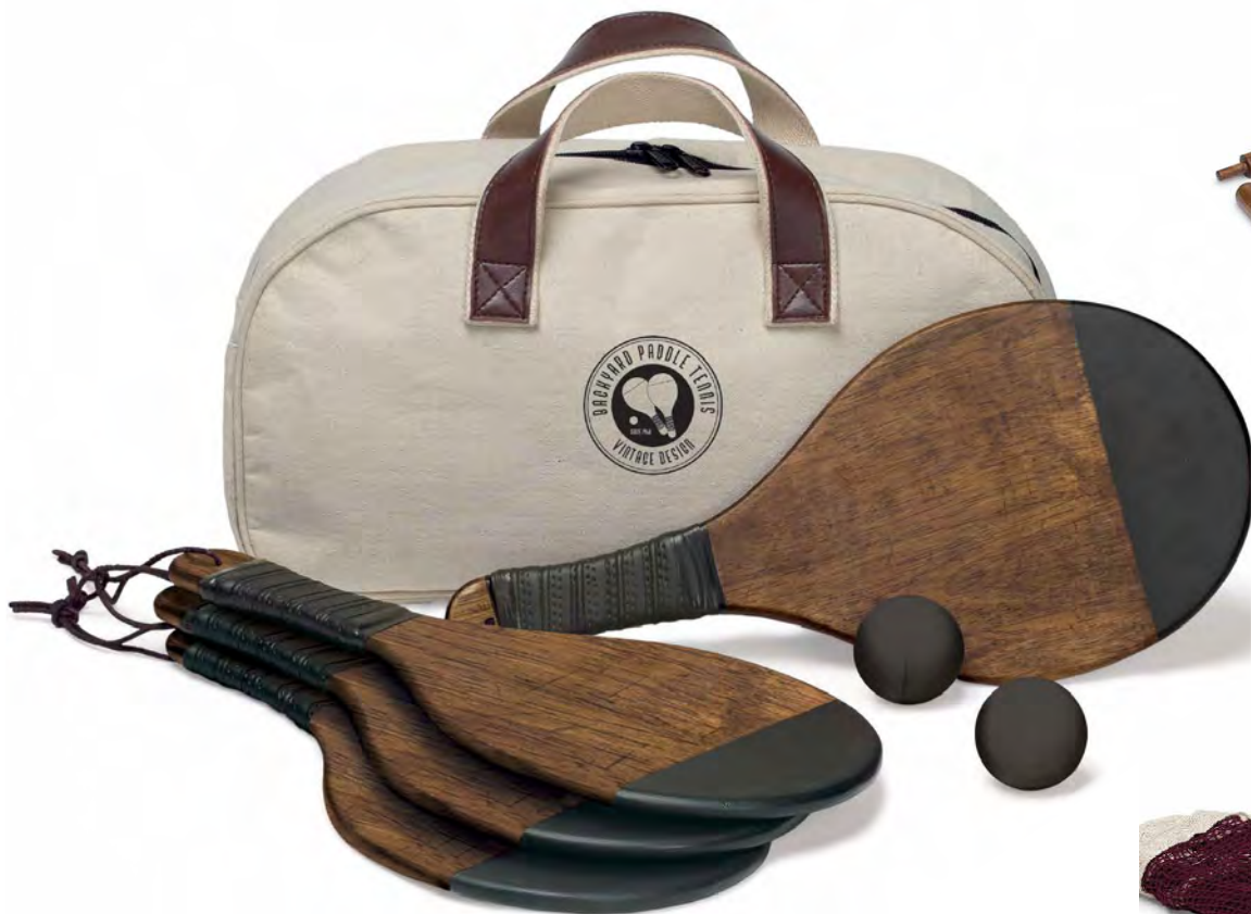
6-pcs Vintage inspired Paddle Tennis set