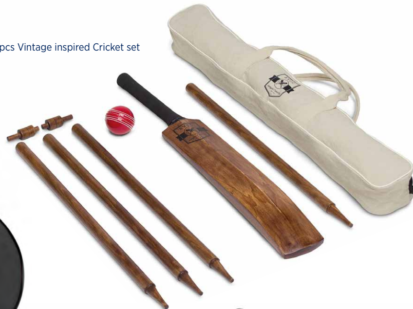
8-pcs Vintage inspired Cricket set