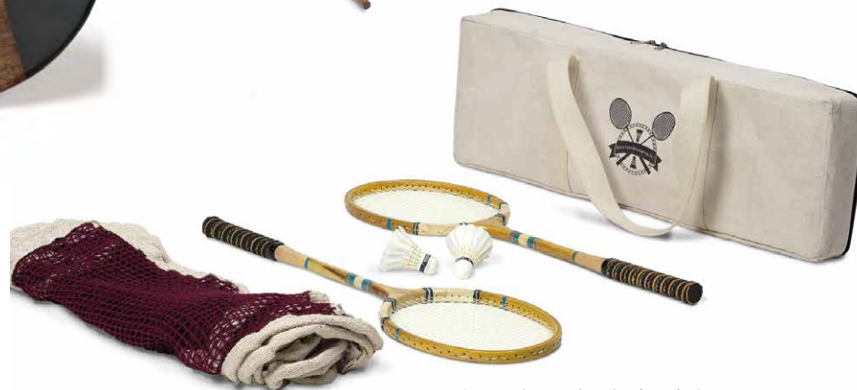
6-pcs Vintage inspired Badminton set