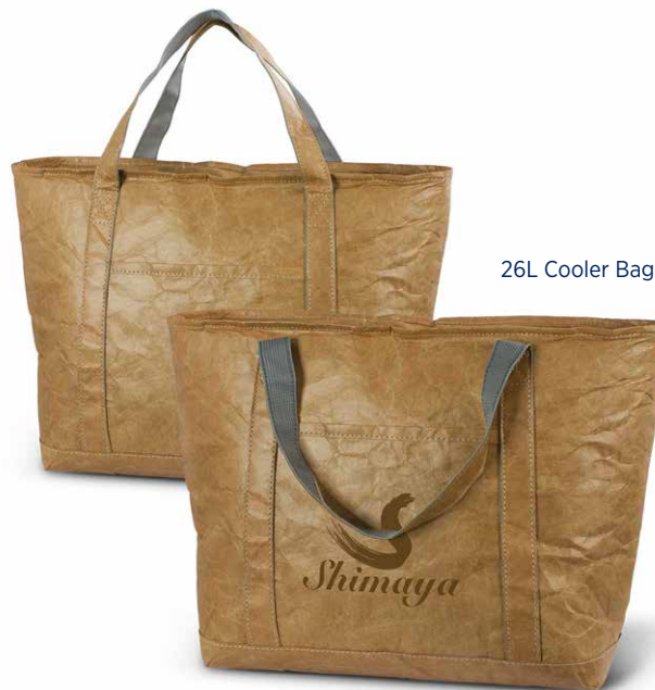
26L Cooler Bag