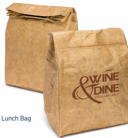
Cooler Lunch Bag

Fashion inspired bags which are manufactured from Tyvek. The Tyvek look has become very popular and the material itself is lightweight and extremely durable. It is resistant to abrasion, tearing and chemicals as well as being colourfast and waterproof.